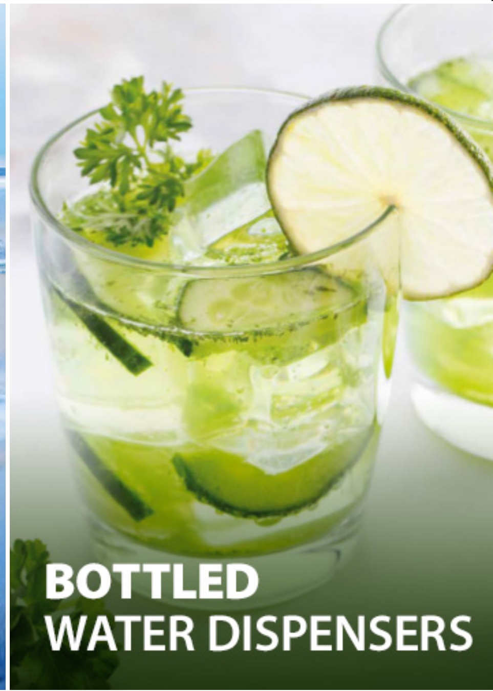
BOTTLED WATER DISPENSERS