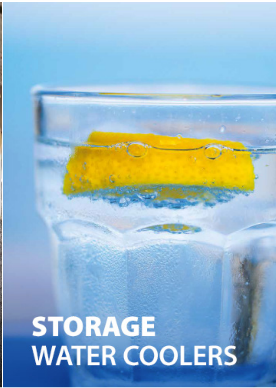
STORAGE WATER COOLERS